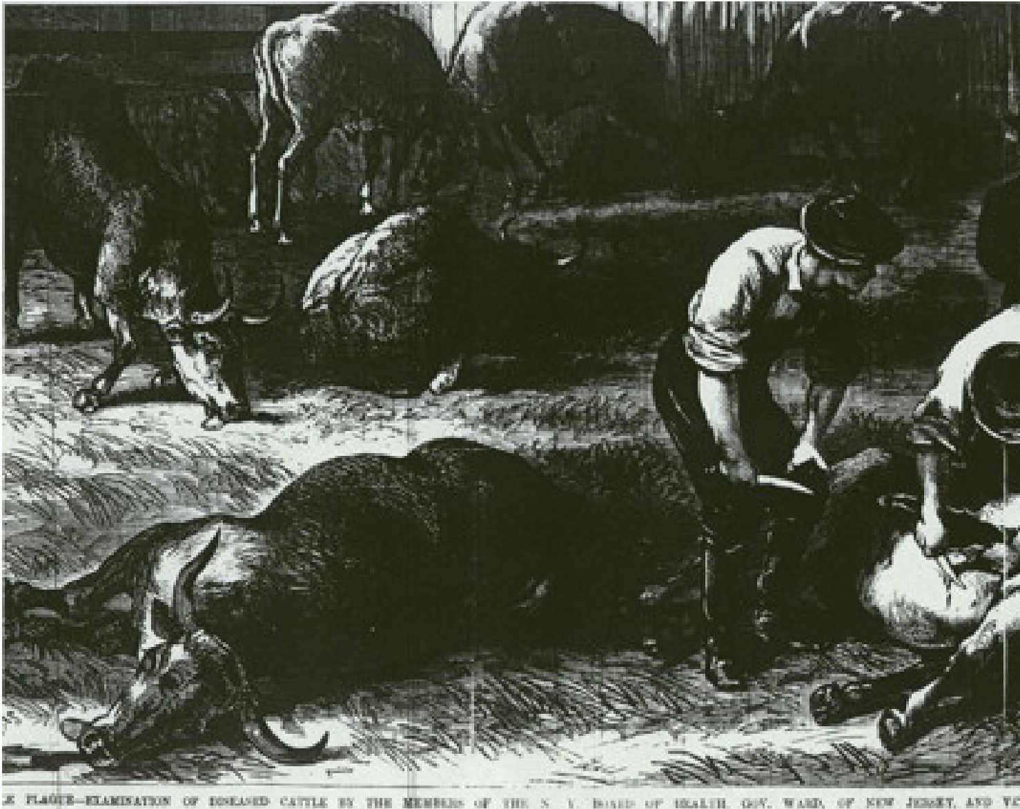
EXAMINATION OF DISEASED CATTLE BY THE MEMBERS OF THE N. Y. BOARD OF HEALTH, GOV. WARD, OF NEW JERSEY, AND YC

Monday, July 23, 2012 12:46 PM - Last Updated Wednesday, February 05, 2014 05:14 PM