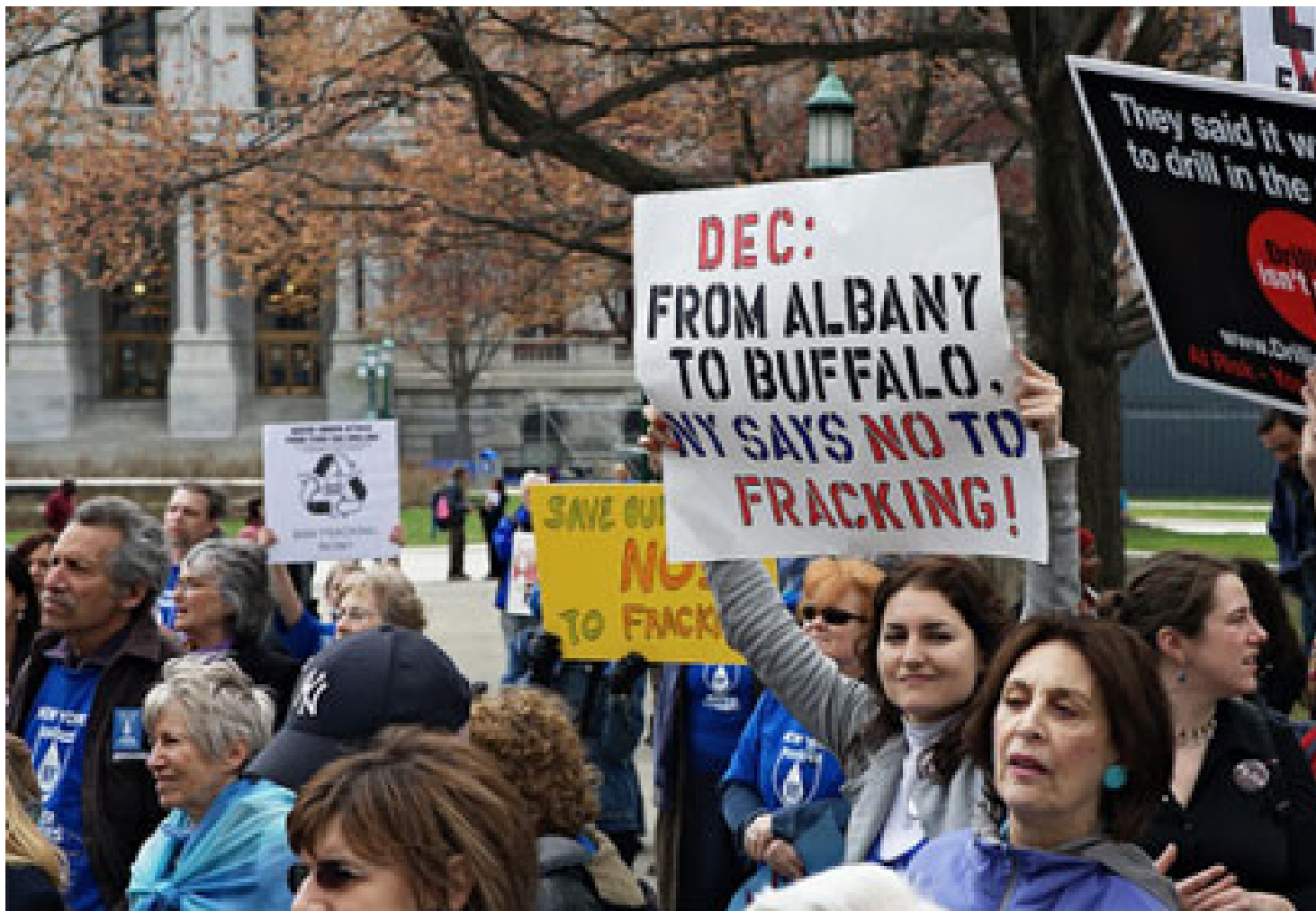
Protestors in Albany demand a ban on hydraulic fracturing.

Sunday, December 18, 2011 12:00 AM - Last Updated Monday, September 29, 2014 03:21 PM