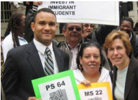
Sierra at a rally in front of City Hall

The race is not just about Yankee Stadium. Both candidates say their community desperately needs more jobs, better access to health care, increased affordable housing and better schools.