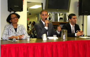
Candidates for the 54th Assembly District meet in Cypress Hills to debate.

(Last month David King profiled the race in the 54th Assembly District in Three Candidates vie in a Special Special Election . The following updates that report.)